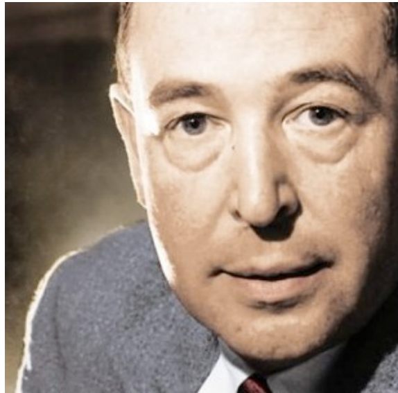
Clive Staples (“Jack”) Lewis (1898—1963)