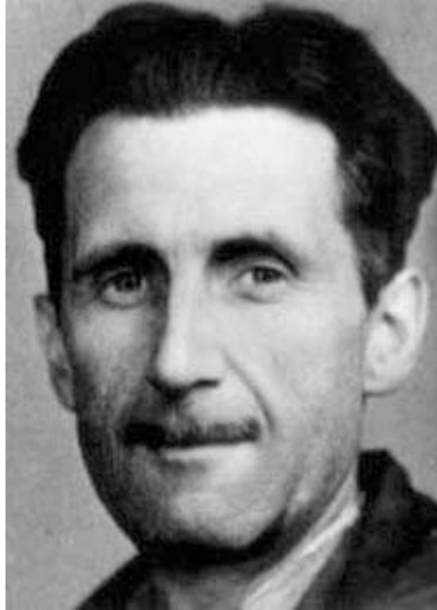
Eric Arthur Blair (George Orwell) 1903-1950