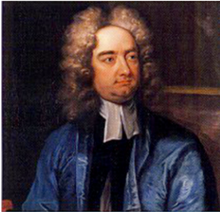
Jonathan Swift 1667-1745

From the author of Gulliver's Travels . . .